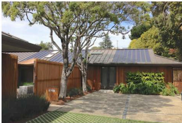
Piedmont's LEED Ranch, designed by Michelle Kaufmann, AIA, added LEED features including rooftop solar collectors, an interior plant wall to clean the air and driveway permeability for water absorption.

BERKELEY -- There's something unique about a new home, addition or remodel designed by an architect who transforms the "before" into an "after" that solves problems and pleases aesthetically. And it's no surprise that touring examples of these homes can be educational, inspiring and fun.